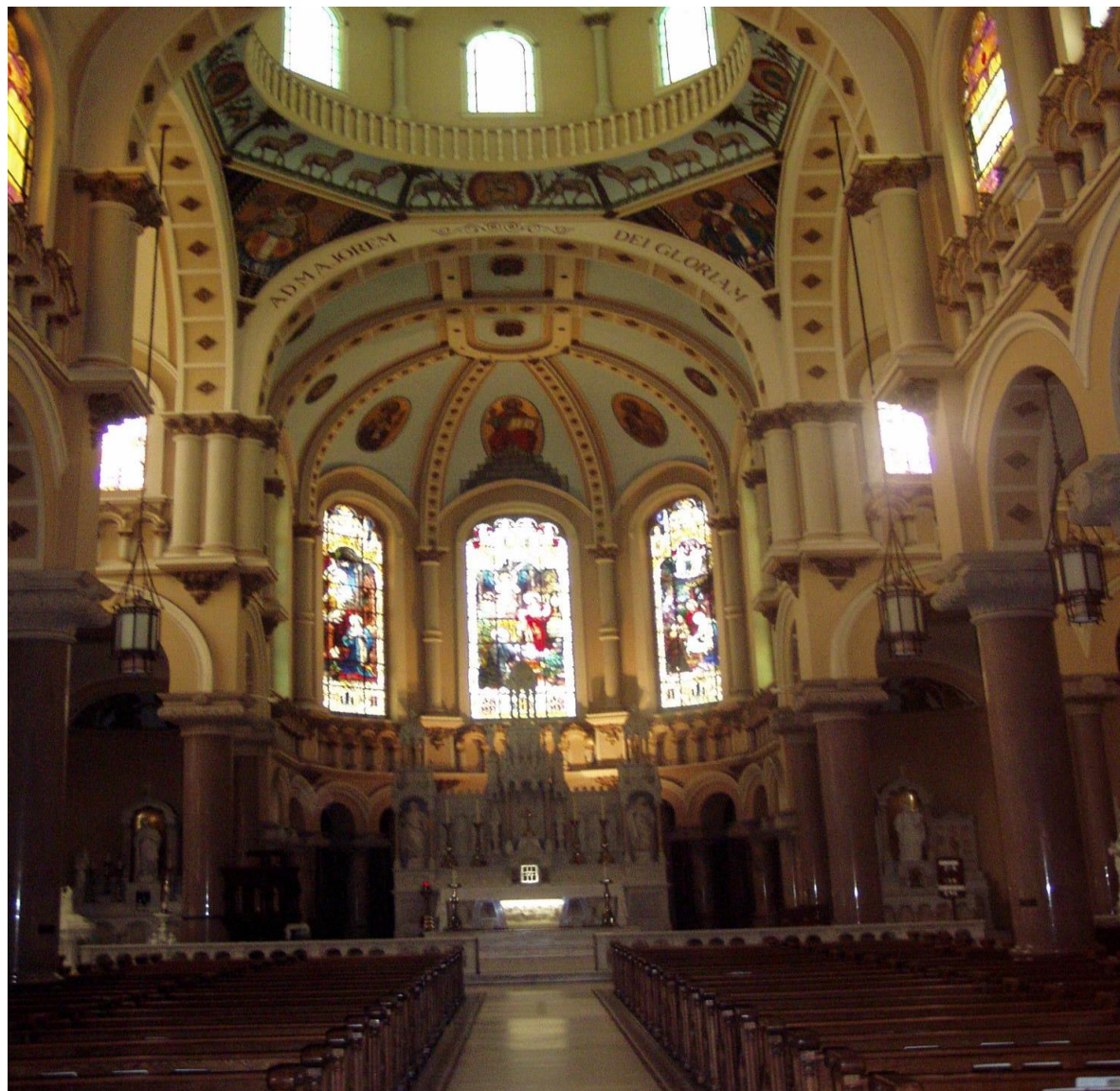
Sacred Heart Church, Tampa